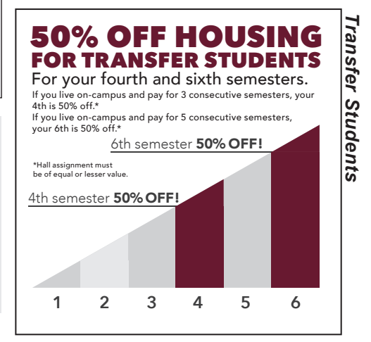
This might affect Financial Aid for both First-Time Enrolled and Transfer Students